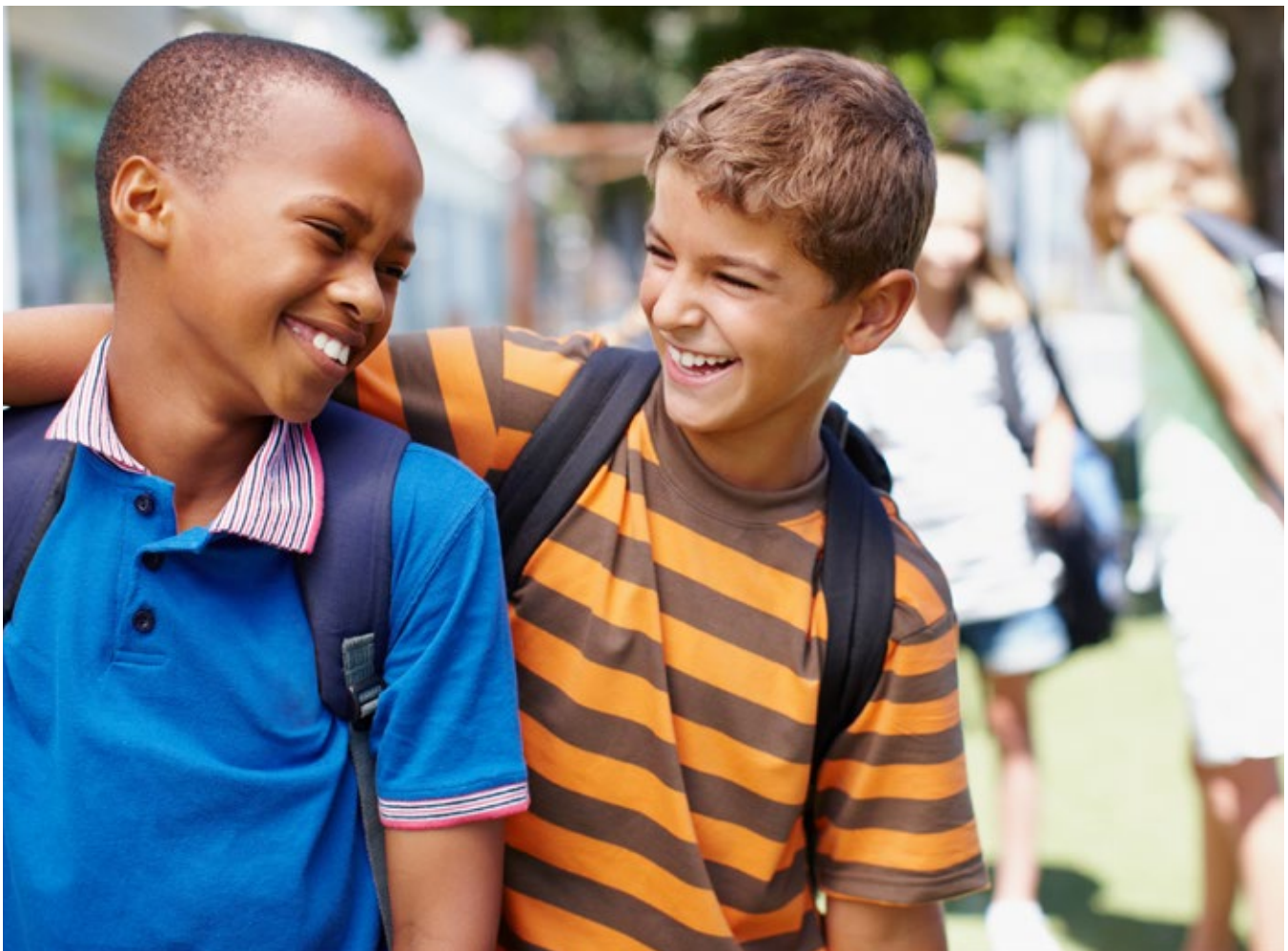
YURI ARCURS - PEOPLEIMAGES.COM